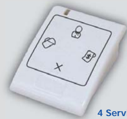
4 Service Button SS-WSB4