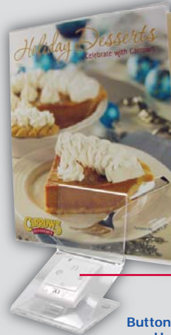
Button & Menu Holder SS-WSH4