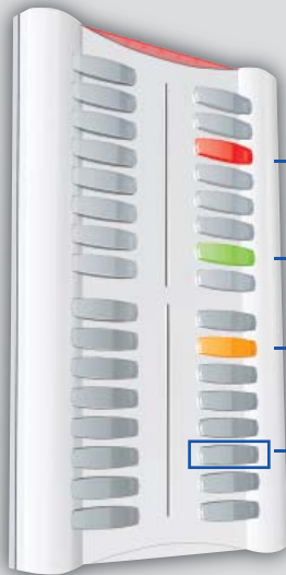
Main Console SS-WSR32